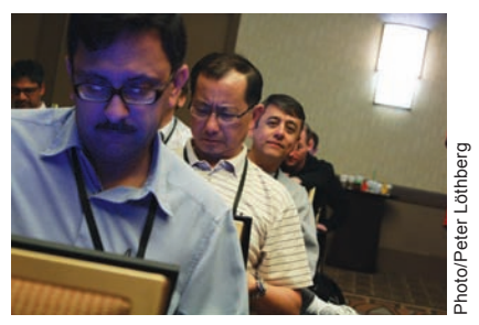
IETF 77 participants attend the opening plenary