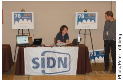
SIDN, which will be hosting IETF 78, prepares for the next meeting while at IETF 77

irtf-discuss.) Another proposal being considered is the creation of a regular open IRTF meeting (similar to an IETF area meeting) as a venue for research topic proposals and other related discussions that do not necessarily fit within the context of an RG meeting. Finally, we are adding dots to IRTF RG chair badges.