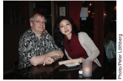
IETF 77 attendees enjoy a break