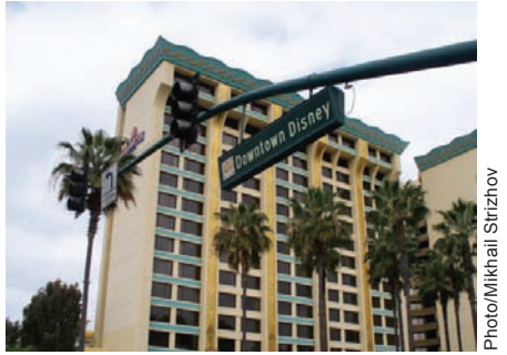
Anaheim, California, site of IETF 7

IPv6 deployment is a regular topic for discussion at IETF, and the IETF 77 meeting was no exception. ISOC organized a well-attended panel session, adjacent to the IETF meeting, that exposed the growing momentum behind IPv6 deployment (see page 9). In